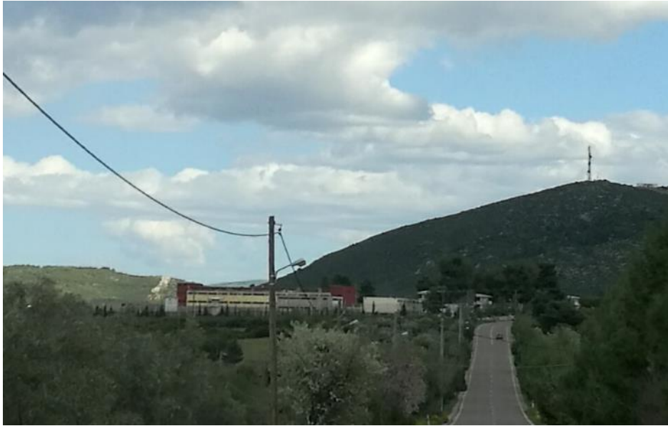
(Avlona Special Correctional Institution for Young Offenders)

March 12 th we travelled from Athens at 0800 to meet the management of Avlona Special Correctional Institution for Young Offenders at 0900. A security check was made and we were followed to the school area of the 2nd Gymnasium and Lyceum in Attica, Greece.